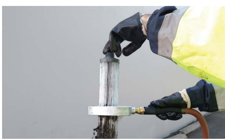
The Jellyfish® Filter tentacle is light and easy to clean.