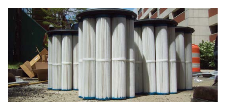
Sources: WA DOE TAPE Testing: https://fortress.wa.gov/ ecy/ezshare/wq/tape/use_designations/ JELLYFISHfilterIMBRIUMguld.pdf