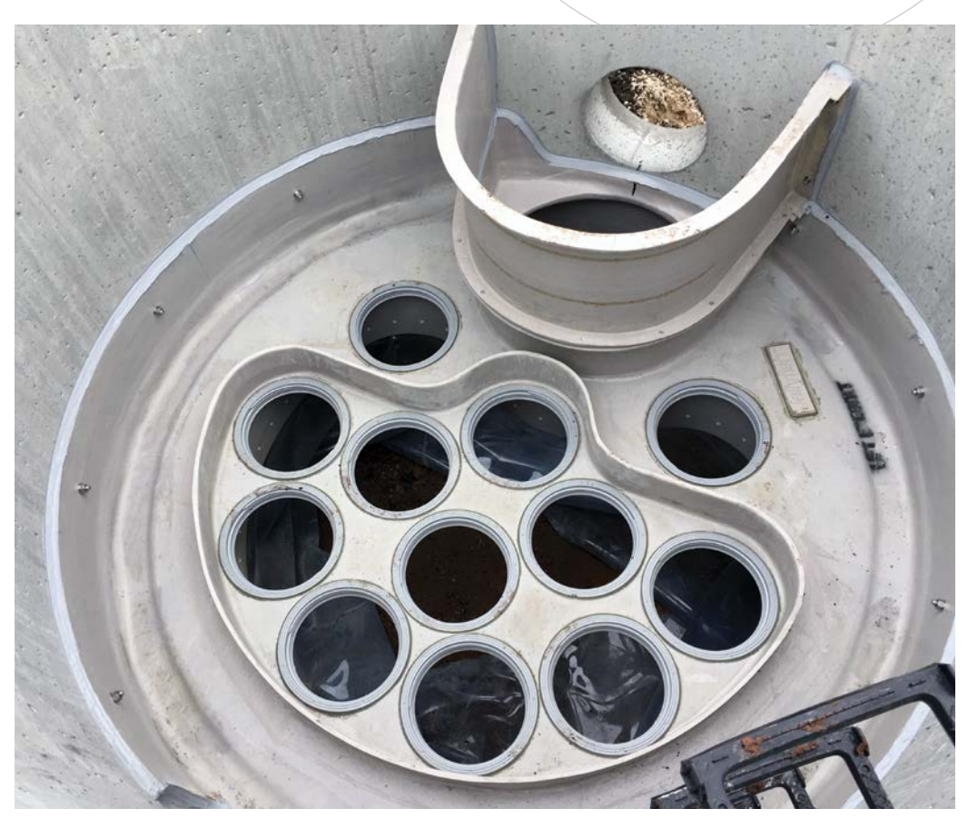
The pleated tentacles of the Jellyfish® Filter provide a large surface area for pollutant removal.