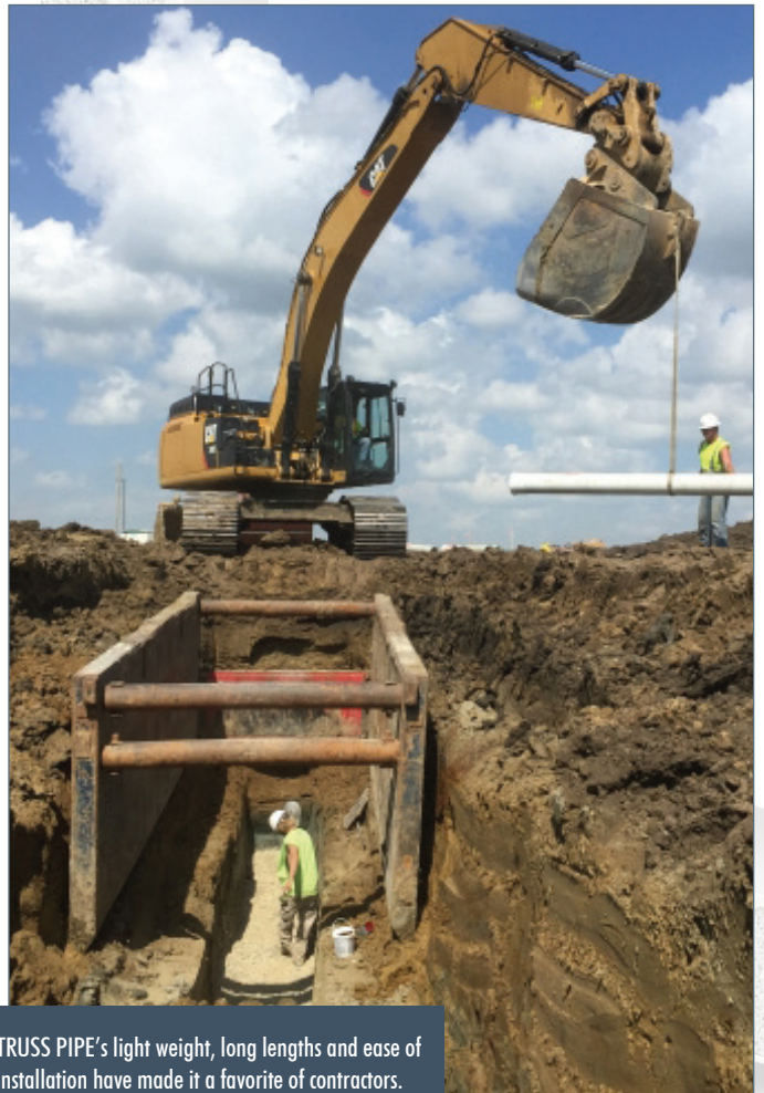
TRUSS PIPE's light weight, long lengths and ease of installation have made it a favorite of contractors.